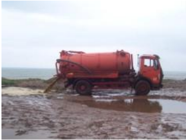
Figure 5: A vacuum tanker discharges its load in Accra, Ghana.

The two predominant problems facing such trucks are cost (both capital and maintenance) and, in urban areas, access to facilities. The machine cost will vary between locations, but a