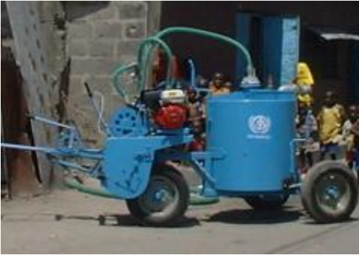
Figure 3: UN-HABITAT Vacutug.