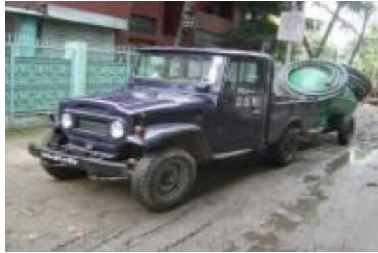
Figure 4: Vacutug Mk II mother tank.

The Vacutug project is still awaiting the scaling up phase. Currently a number of machines are on trial throughout the world, and governments are being encouraged to take the lead on purchasing. The machine has a capacity of 500 litres, has a maximum speed of 5 km/hour, and comes at an approximate cost of US$5,000 – 7,000 (dependent on shipping costs). It can be difficult to completely empty deep pits, partially due to pit depth and partially due to sludge compaction.