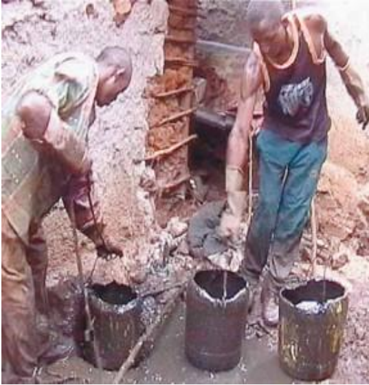
Figure 2: Manual emptiers operating in Kibera, Nairobi

In many urban areas of the world manual emptying methods dominate the sector. Manual emptying occurs most frequently where large vacuum tankers are unable to access sanitation facilities. It is also generally the cheapest way of removing enough waste to keep a pit operational, although it is usually the most expensive per unit volume.